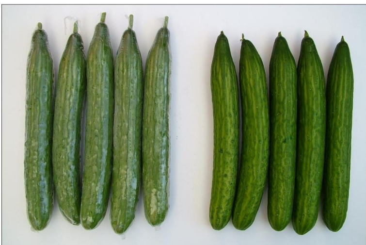
Wrapped (left) and naked (right) cucumbers 14 days later