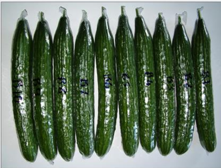
Shrink wrapped cucumbers immediately after harvest average weight 390g